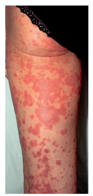
Figure 2. Severe psoriasis lesions on the skin.

Examination of the skin showed generalized, confluent, inflammatory psoriatic plaques with a tendency towards erythroderma (Fig. 2). The PASI score was estimated at 27.3 points. The oral mucosa was unaffected. Body mass