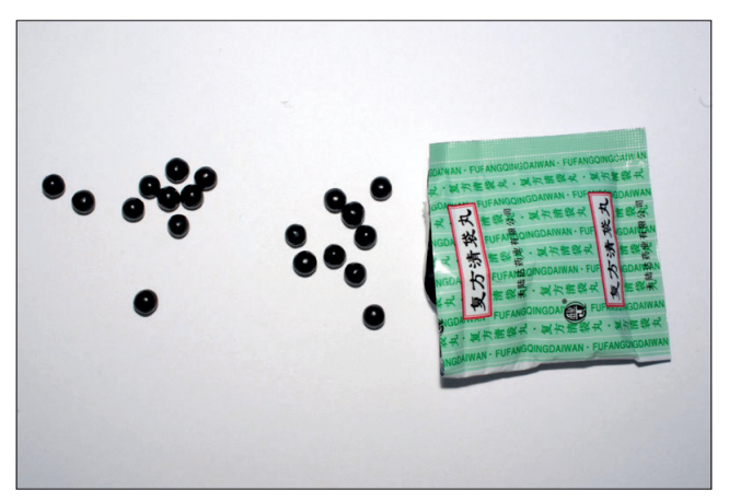
Figure 1. Commercial package of Chinese herbs available over the counter.

Lublin. The patient had a 30-year history of localized chronic plaque-type psoriasis with lesions on the knees, elbows and forehead. Previously her condition was rather stable and did not require any systemic treatment or hospitalization. Because of the long time presence of psoriatic plaques and lack of expected positive results following application of topical preparations, the patient decided to seek alternative treatment and finally resorted to Chinese herbal medicine. She was recommended to take Fu Fang Qing Dai Wan by mouth and the dose was specified as one unlabelled sachet (Fig. 1) of the herbal preparation three times daily. She also used some unlabelled herbal bath gel as well as staying on a special diet which consisted of daily rations of carbohydrates,