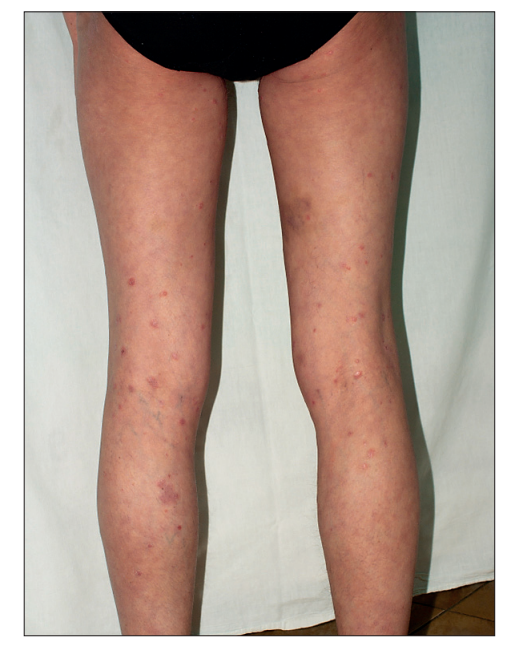
Figure 4. Patient's lower extremities following discontinuation of the herbal preparation.

The lipophylic compounds extracted from the herbs had no chelating ability, whereas the hydrophilic compounds (extracted with PBS) showed a strong chelating power. This